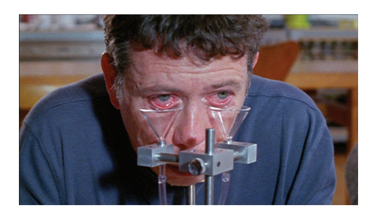
Desire Management, 2005

Desire Management is a film comprising five sequences in which objects are used as vehicles for dissident behaviour. In the film, the domestic space is defined as the last remaining private frontier for our desires. It portrays places where bespoke appliances provide unorthodox experiences for alienated people: an airline hostess re-enacts her job in simulated turbulence; the owner of a mysterious box which men ritually visit to look inside; an elderly man who enjoys being vacuumed whilst naked; a couple who engage in baseball driven fantasies, and a man who is coaxed by his partner to cry into a strange device for flavouring her tea. Based on real testimonials and news reports, the objects all specifically created for the film attempt to reveal the inherent need for expression and identity formation in the face of conformity. In contrast to the modernist ideals of transparency, the work actually posits that the effects on the human subject through exposure to the outer world causes us to seek the spaces for utopian desire in the inner subjective world.